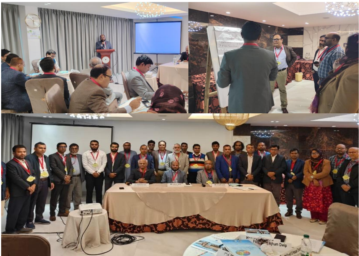
Figure 7. Inaugural session and active engagement of participants in the activity sessions

The Course was strategically placed as a refresher and skill development course to elevate the practitioners who have basic familiarity with the governance issues to engage in effective consultation with experts and other stakeholders with scientific insights and novel thinking.