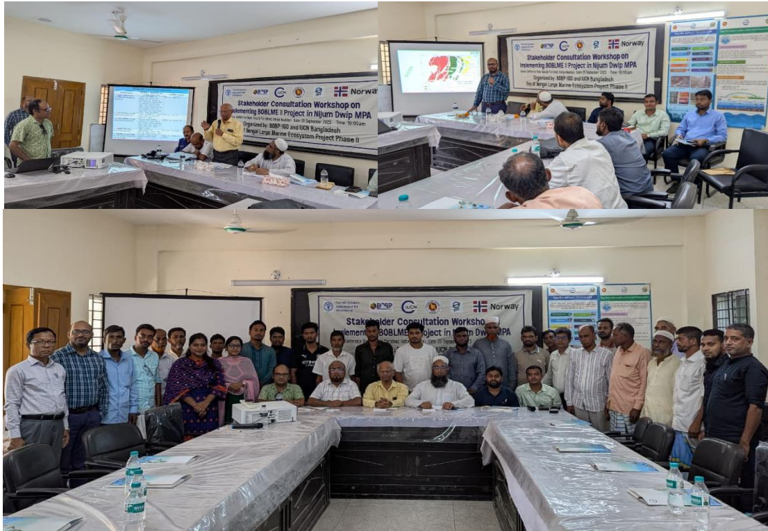
Figure 2. Interaction with stakeholders related to Nijhum Dwip fishery during the consultative workshop

On 25 September 2025, the BOBP and IUCN-Bangladesh jointly organized a Consultative Workshop for Scoping the fishery and biodiversity conservation in Hatiya and Nijhum Dwip.