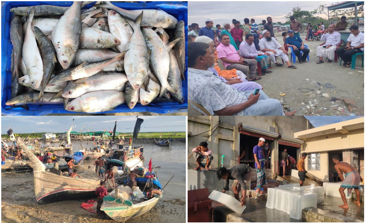
Figure 3. The project team visited fish landing center, ice plant, boat dock yard, fishing village and held discussions on the fishery in Hatiya Island and Nijhum Dwip

The team interacted with a number of stakeholders including fishers, ice manufactures and traders to gain an insight into the characteristics, and issues and opportunities to improve the fisheries in the Island.