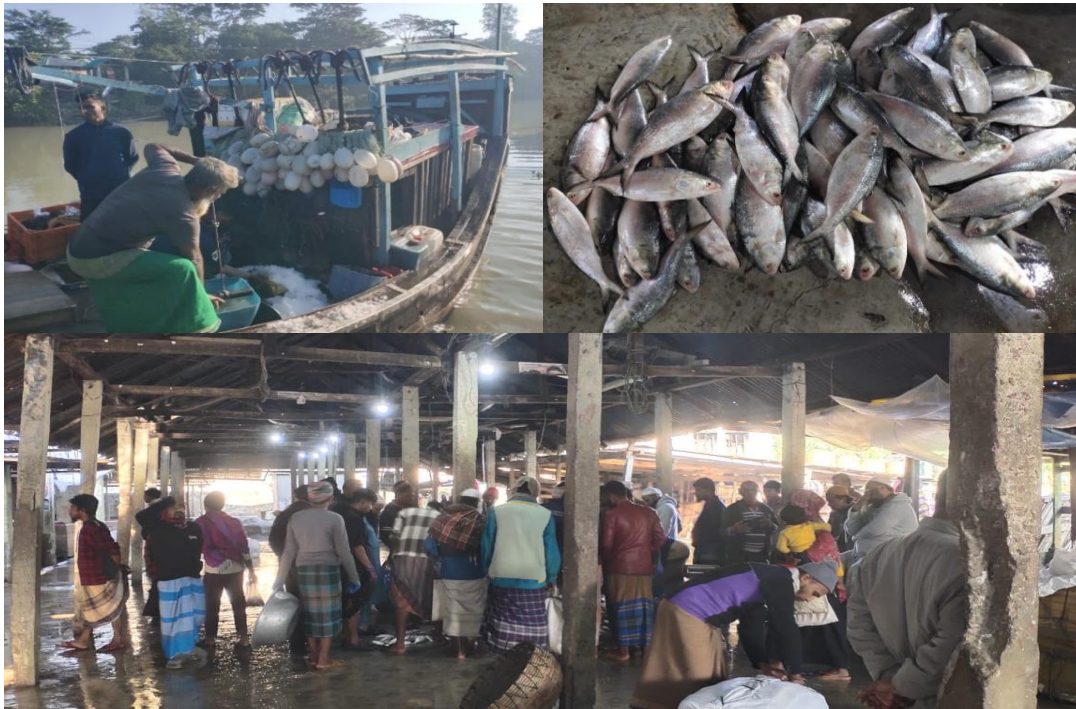
Figure 5. The project team visited fish landing center and fishing village and held discussions on the fishery in Barguna

The team interacted with a number of stakeholders including fishers, traders and co-management model village to gain an insight into the characteristics, and issues and opportunities to improve the fisheries in the Barguna.