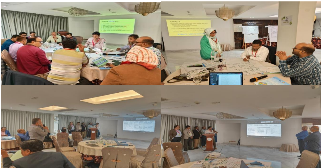
Figure 8. Participants presenting their group activity outcome and also role play session

The course ran seamlessly and at a good pace throughout. The participants actively participated in the entire Course. About half of the time of the Course was allotted to group exercises that generated lot of interest, and were found to promote better understanding, active involvement and real-world application. The participants had hands-on experience of preparing EAFM model plans for the two fisheries, and more importantly, got an insight into the procedure for preparing the plan. The participants took great interest in the role play on conflict resolution for the two FMUs.