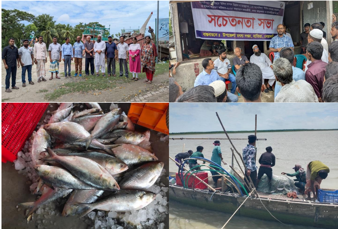
Figure 6. Images of fishing activity and consultative meeting in Nijhum Dwip