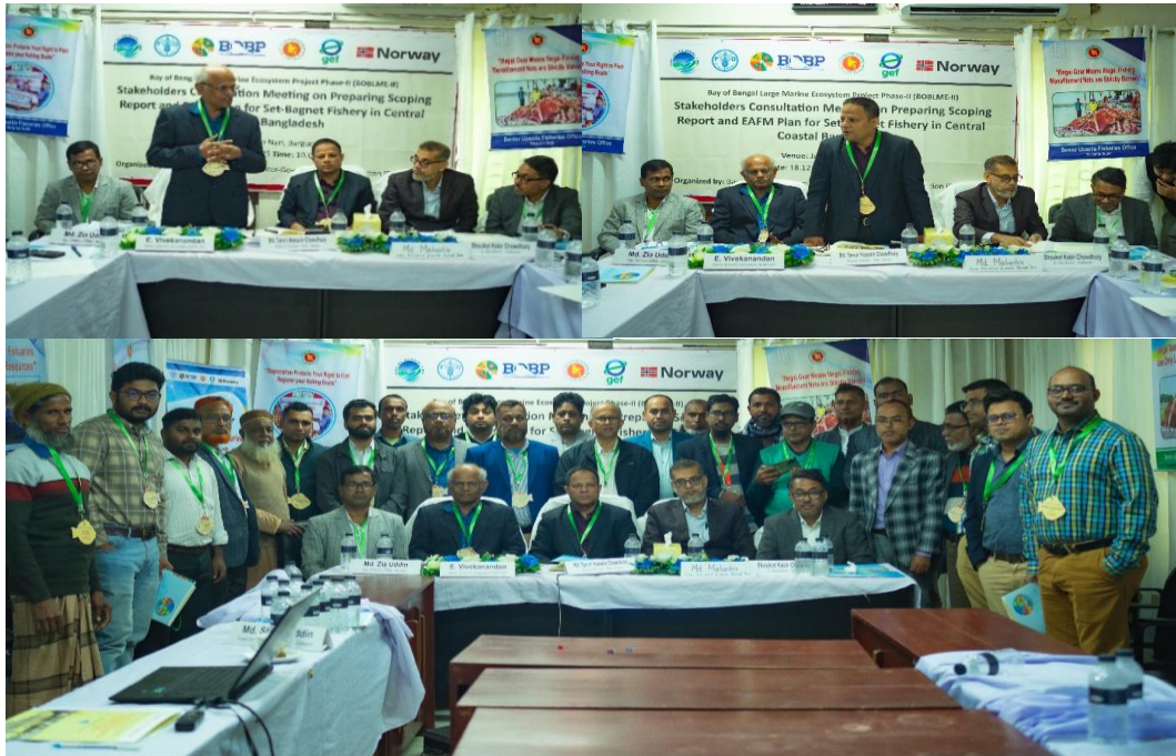
Figure 4. Interaction with stakeholders related to Set Bag Net Fishery during the consultative workshop

On 18 December 2025, the BOBP and IUCN-Bangladesh jointly organized a Consultative Workshop for Scoping the fishery and biodiversity conservation in Barguna.